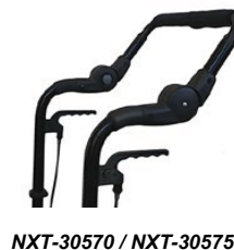
NXT-30570 / NXT-30575