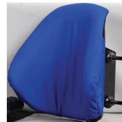
Blue Blizzard Startex Fabric