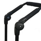
NXT-30580 / NXT-30585