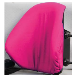
Pink Lollipop Startex Fabric