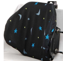
Kid*a*bra Meshtex Fabric